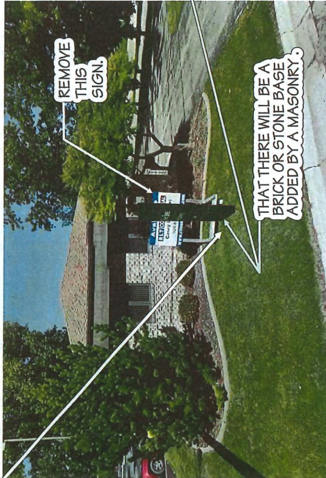
SINGLE SIDED MONUMENT SIGN

**2' PERIMETER OF LANDSCAPING WILL BE HANDLED BY THE LANDLORD/TENANT**