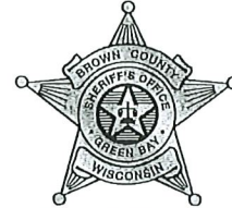
Todd Delain SHERIFF

2684 DEVELOPMENT DRIVE GREEN BAY, WISCONSIN 54311 PHONE (920) 448-4200