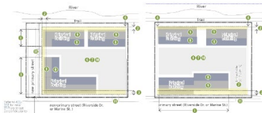
Building and Parking Siting