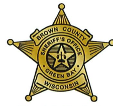
Todd Delain SHERIFF

2684 DEVELOPMENT DRIVE GREEN BAY, WISCONSIN 54311 PHONE (920) 448-4200