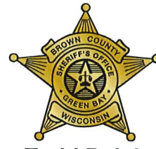
Todd Delain SHERIFF

2684 DEVELOPMENT DRIVE GREEN BAY, WISCONSIN 54311 PHONE (920) 448-4200