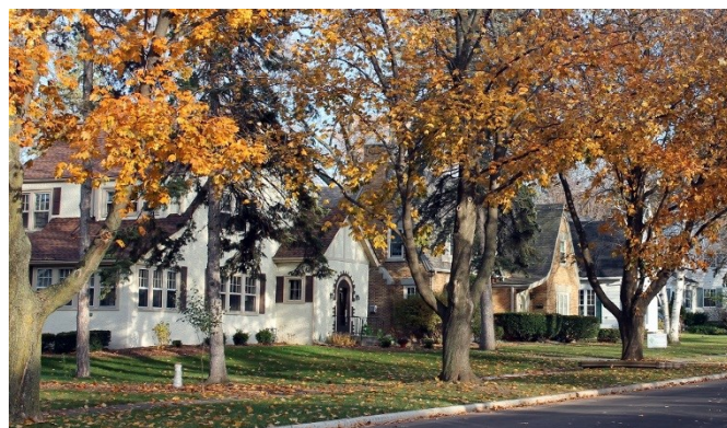
Miramar Drive Residential Historic District, Allouez