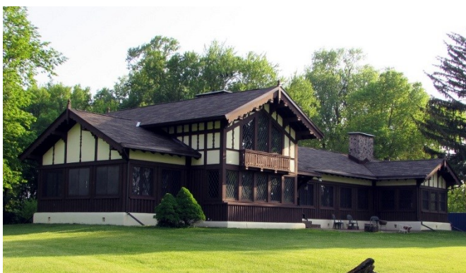
Dr. Adolf & Helga Gundersen Cottage, La Crosse