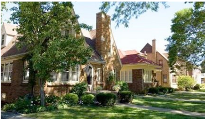
Melvin Avenue Residential Historic District, Racine