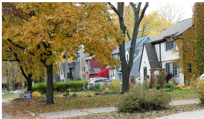
Robinson Hill Residential Historic District, Allouez