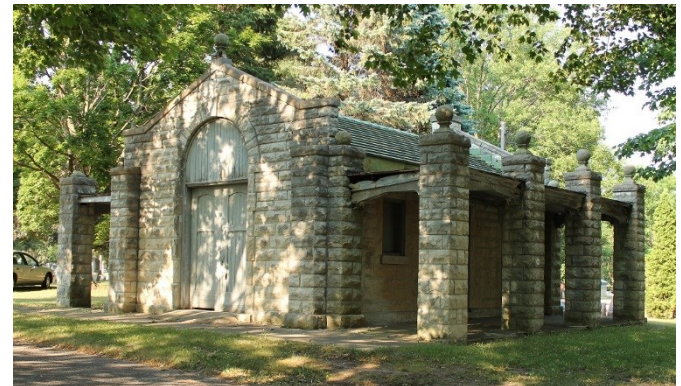
Burlington Cemetery Chapel, Burlington