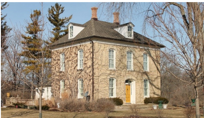
Charles & Herriette Klingholz House, Manitowoc Rapids