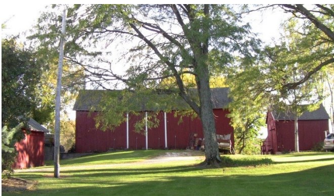
Michael & Margaritha Beck Farmstead, Jefferson