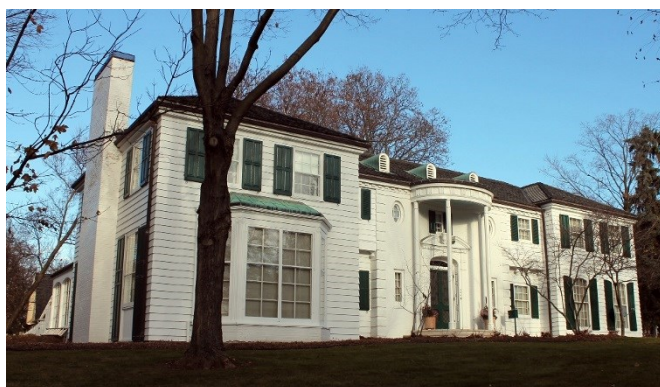
Albert C. Neufeld House, Allouez