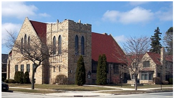
Downtown Churches Historic District, Sheboygan