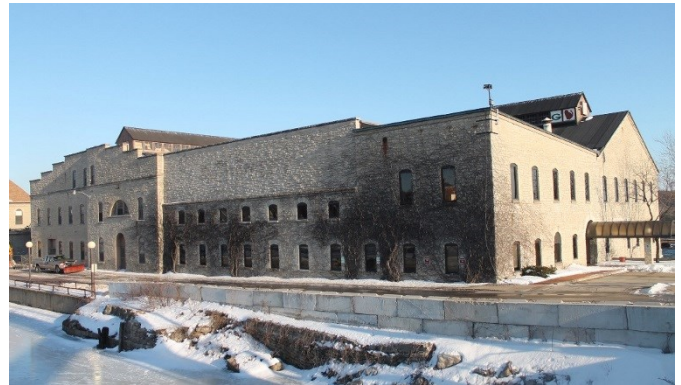
Eagle Paper & Flouing Mill, Kaukauna