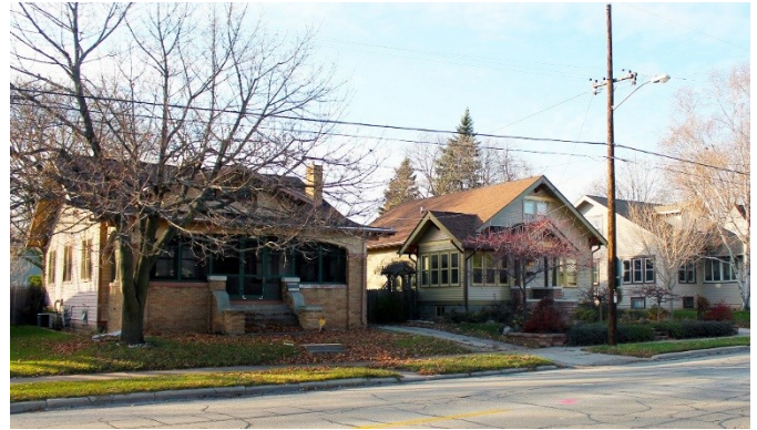
North Main Street Bungalow Historic District, Oshkosh