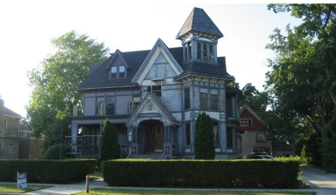
East Division Street-Sheboygan Street Historic District, Fond du Lac