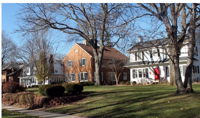
Milwaukee - Emerson Residential Historic District, Beloit