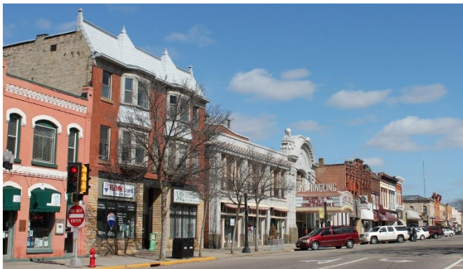
Downtown Baraboo Historic District, Baraboo