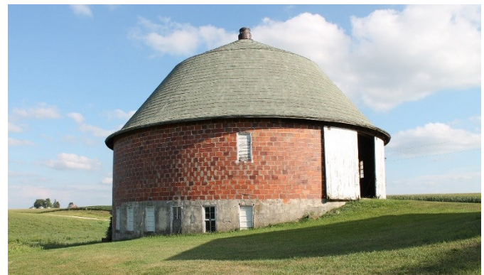
Bert & Mary Cunningham Round Barn, Viroqua