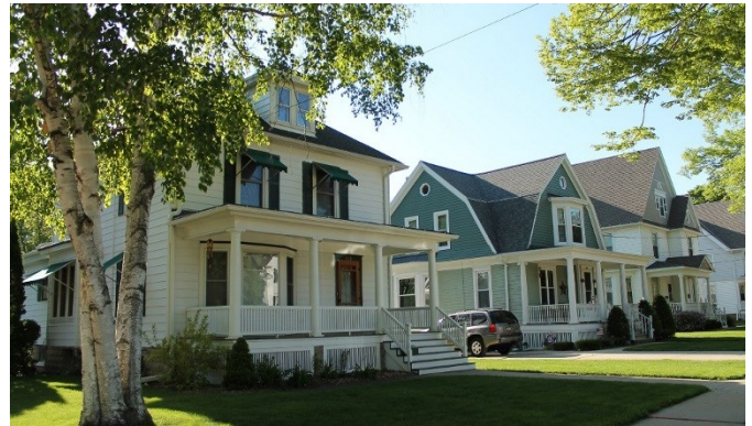
Richards Hill Residential Historic District, Watertown