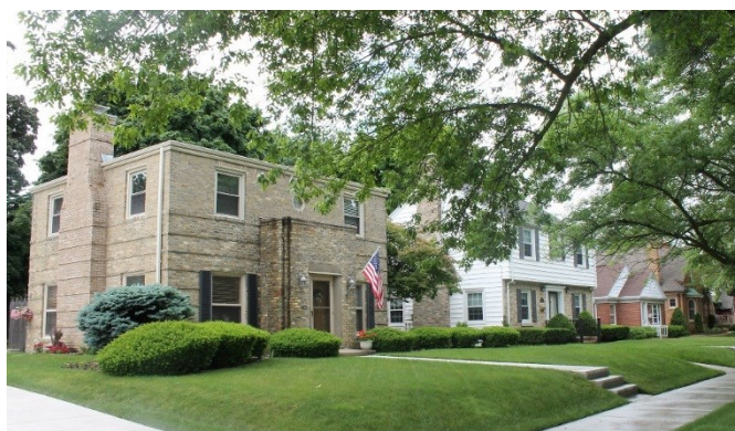
Orchard Street Residential Historic District, Racine