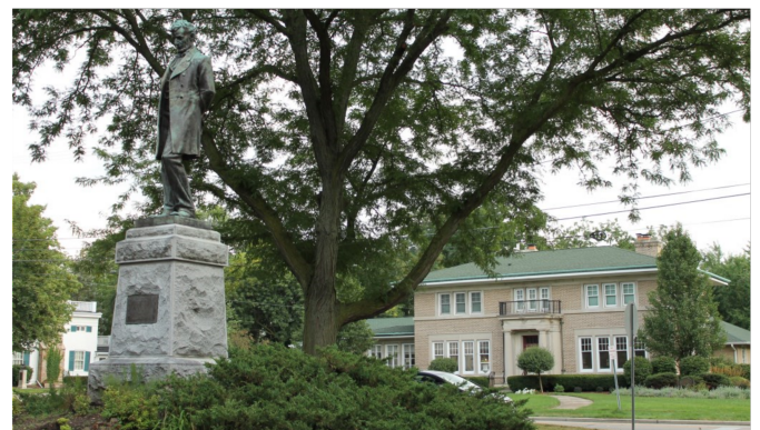
Kane Street Historic District, Burlington