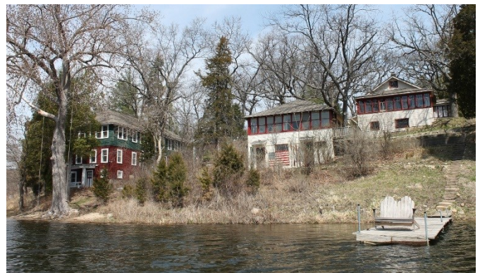
Wandawega Inn, Sugar Creek