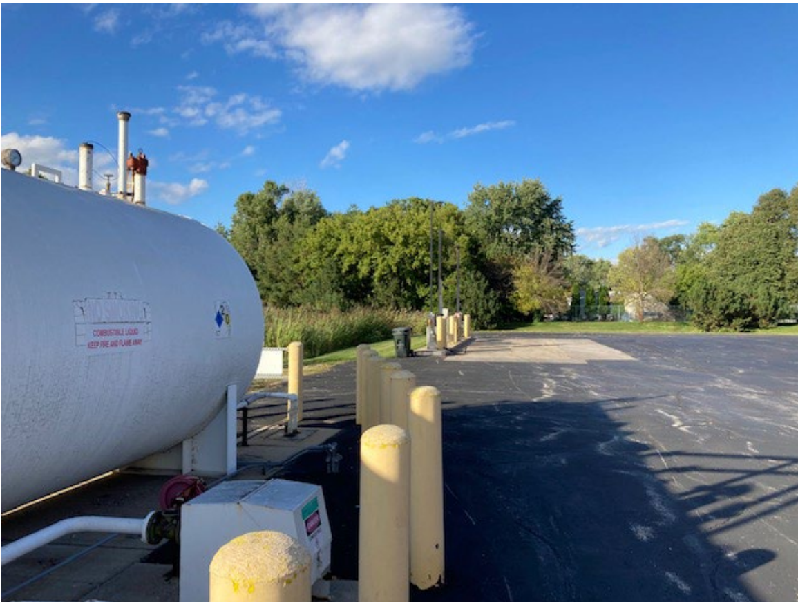
Picture of Diesel and Gas Tank