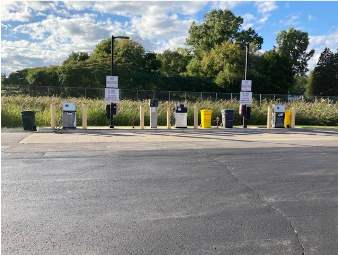
Picture of Ex. Fuel Island