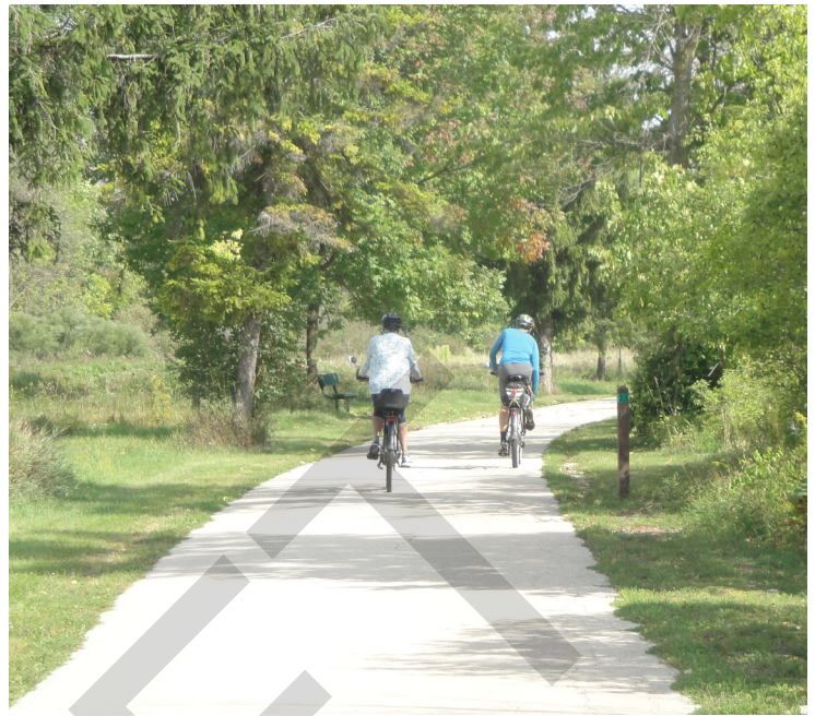
Resch Family East River Trail.

East River Parkway , a 102.2-acre parkway located along the west side of the East River in the eastern portion of the village. Recreation facilities include the Resch Family East River Trail, which is a 2.7-mile-long multi-purpose recreation trail. The majority of the trail is located between Green Isle Park and Lebrun Road, while a small portion is located within East Lawn Park.