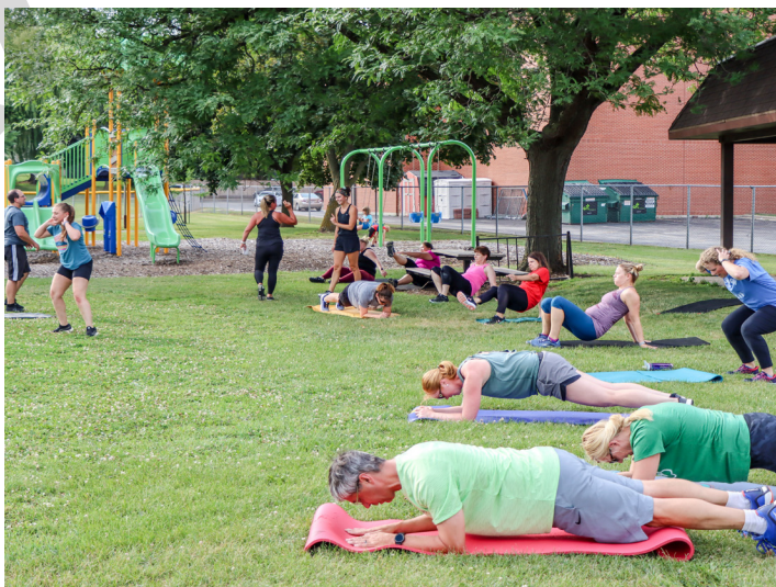
2023 Fit in the Parks class at Langlade Park. Village of Allouez Parks Department.

Langlade Park , a 6-acre park located southeast of the intersection of Broadview Drive and Ravine Way in the central portion of the village behind the Broadview YMCA. Recreation facilities include a softball field, two tennis courts, one basketball court, playground equipment, a shelter building, a picnic area, and weather permitting an ice-skating rink in the winter.