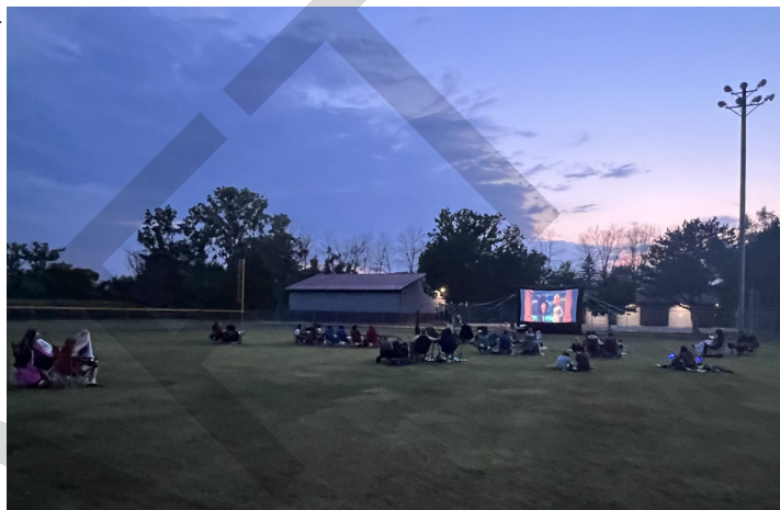
Movie in Green Isle Park. Village of Allouez Parks Department.

Green Isle Park , a 51-acre park located at the northeast corner of the intersection of East River Drive and STH 172 in the eastern portion of the village along the East River. Recreation facilities include one lighted baseball field, one lighted softball field, four tennis courts, a basketball court, a soccer/football field, playground equipment, a gazebo, two pavilions, picnic areas with grills, an athletic course, nature/cross-country ski trails, an ADA canoe/kayak launch, three fishing piers, and a portion of the Resch Family East River Trail. This park is also part of the East River Parkway.