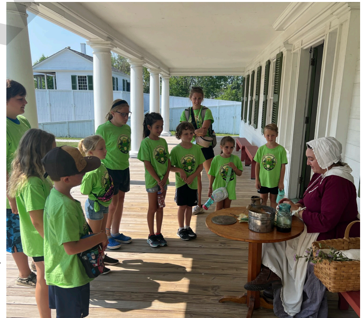
Heritage Hill State Park. Village of Allouez Parks Department.

Heritage Hill State Park - The Wisconsin Department of Natural Resources owns and maintains Heritage Hill State Park, a 55-acre outdoor historical museum located west of the intersection of Webster Avenue and Greene Avenue in the central portion of the village. The site recreates the early life of the settlers of northeastern Wisconsin through a combination of exhibits, actors, and displays. Numerous buildings of historical significance are also located within this site, including five that are listed on the national and state registers of historic places.