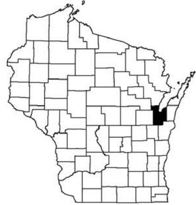
Brown County, Wisconsin